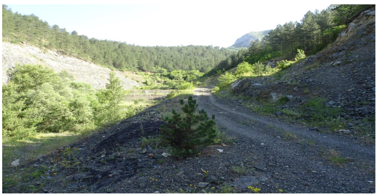
Figure 3 Site of RWMC Banjica (Site visit, July 2021)